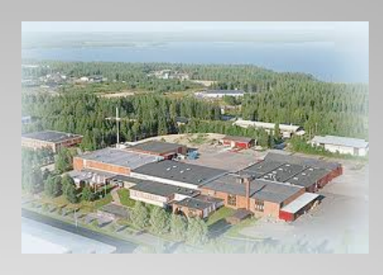
Example of a factory only – not related to geothermal factory

Total Investment: €100 million excluding any subsidies and grants.